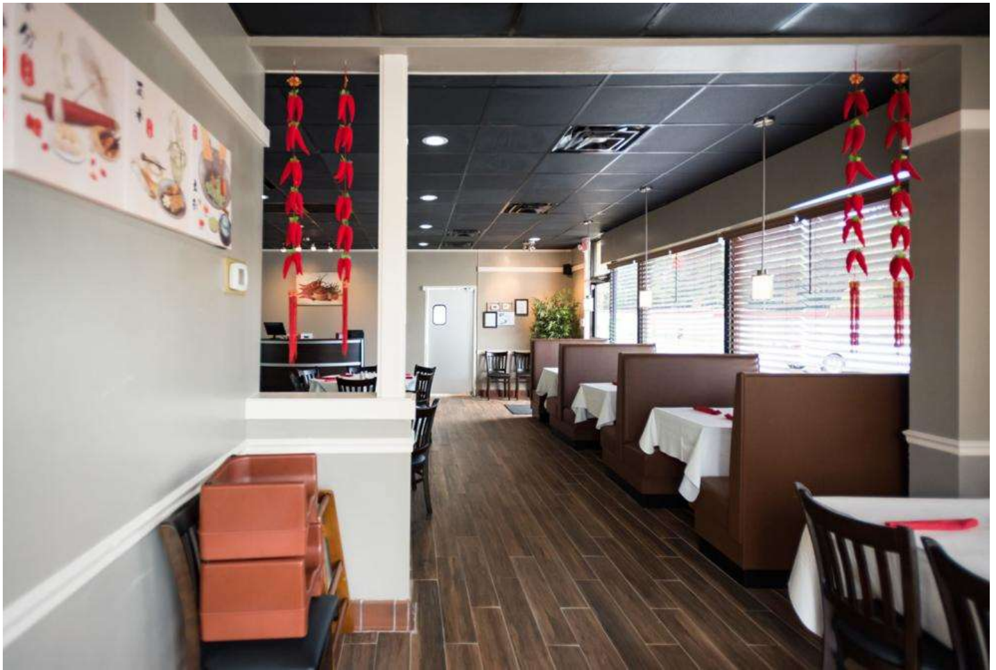
New Sichuan on Thursday, Sept. 5, 2019, at 2125 Silas Creek Parkway in Winston-Salem, N.C.