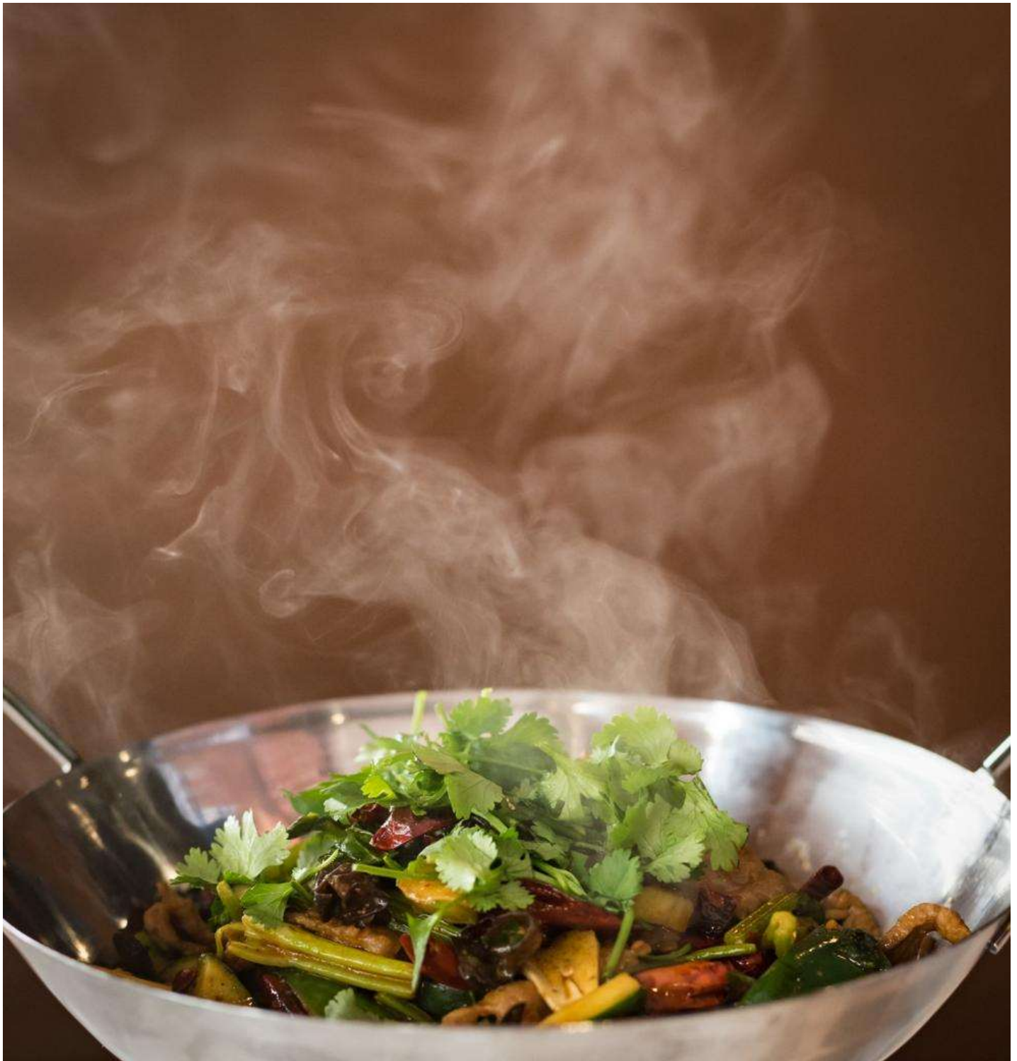
Dry Pot Pork at New Sichuan on Thursday, Sept. 5, 2019, at 2125 Silas Creek Parkway in Winston-Salem, N.C.