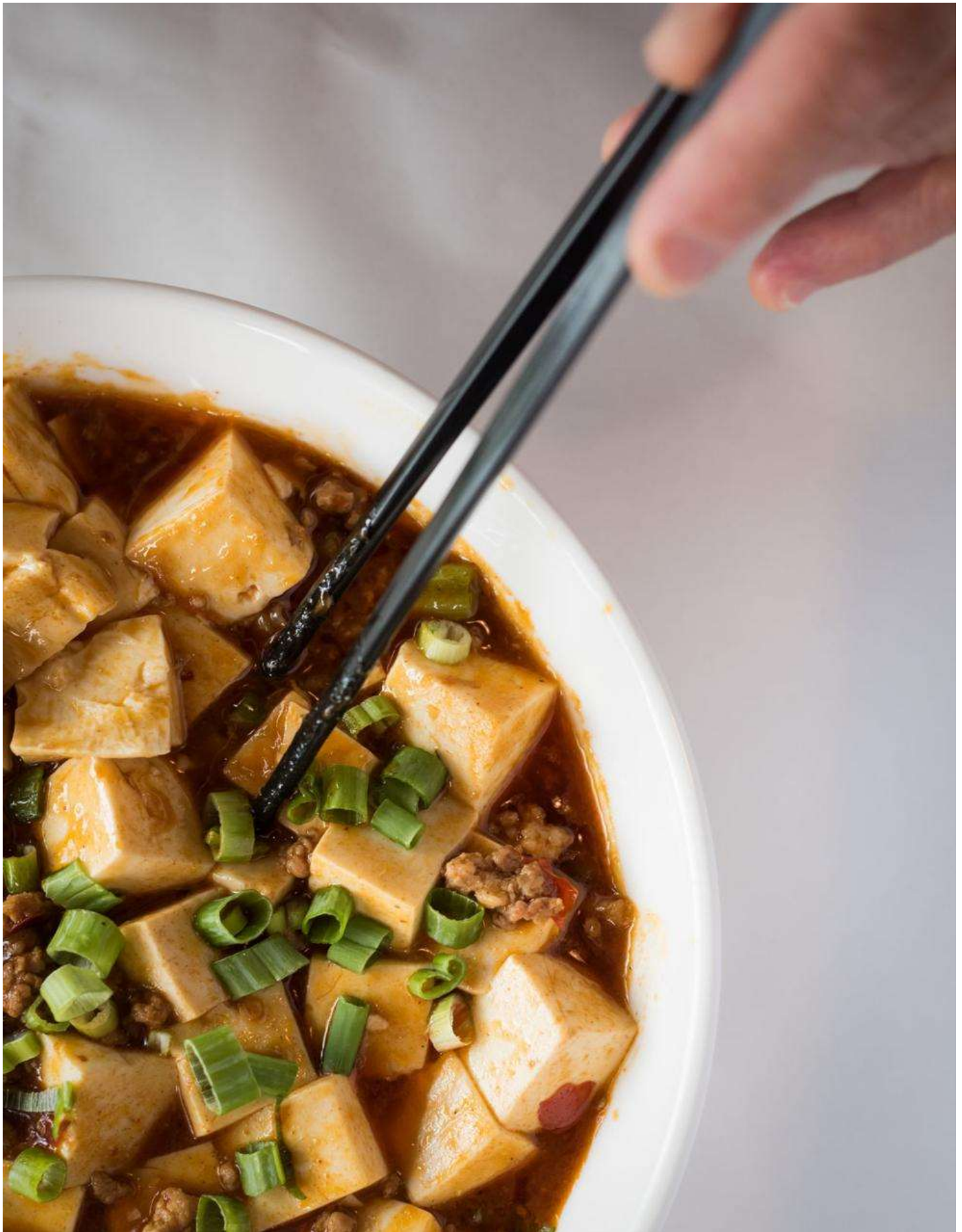
Ma Po Tofu at New Sichuan on Thursday, Sept. 5, 2019, at 2125 Silas Creek Parkway in Winston-Salem, N.C.